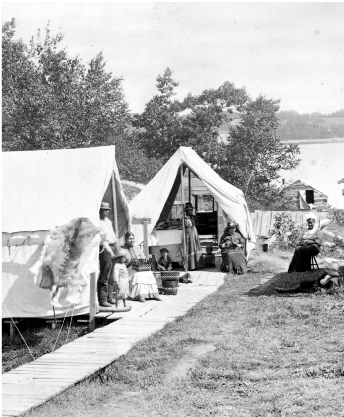
Pictured: Wabanaki encampment in Bar Harbor, Maine

With the advent of the United States, tourism to Maine, specifically to Mount Desert Island, increased, and Wabanaki people, having always lived on the Island, began to alter traditional patterns. To appeal to the tourist market, Wabanaki people traveled to the larger towns on the Island, such as Bar Harbor and Southwest Harbor, during the summer season to sell baskets and beadwork and serve as hunting and fishing guides.