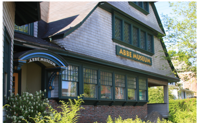
Pictured: Exterior of the Abbe Museum Downtown