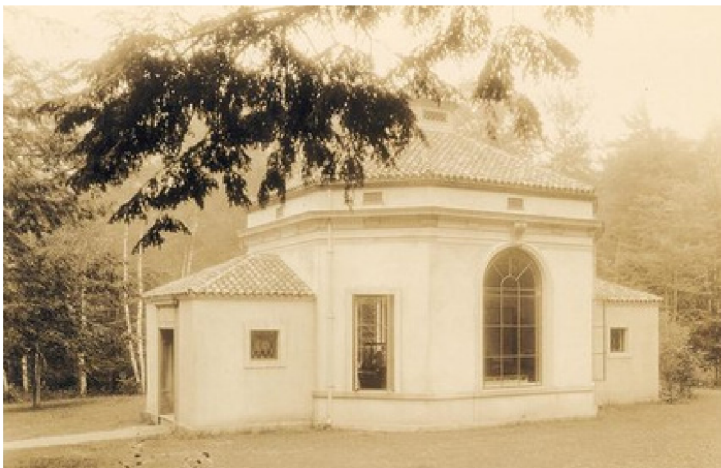
Pictured: Historic photo of the Abbe Museum at Sieur de Monts

By the 1990s, the Abbe's 2,000-square-foot museum at Sieur de Monts Spring had become inadequate to house the growing collections and provided no space for indoor programs, changing exhibitions, or research. In 1997, the Abbe purchased the former YMCA building in downtown Bar Harbor. Opened in 2001, the Abbe Museum Downtown focuses on the history and contemporary life, communities, and art from the four federally recognized tribes of Maine: the Maliseet, Mi'kmaq, Passamaquoddy, and Penobscot, collectively known as the Wabanaki.