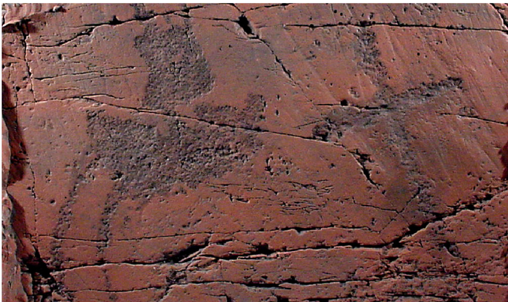
Pictured: Wabanaki petroglyphs

In the mid-1500s, European settlers started arriving in the region, initially for fishing, but later, in larger numbers, they came to settle. Their arrival had a significant impact on Native communities, introducing new materials for trade and diseases that killed over 90% of the population in some areas and influenced changes in subsistence patterns.