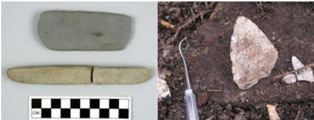
Stone Abraders Stone Points