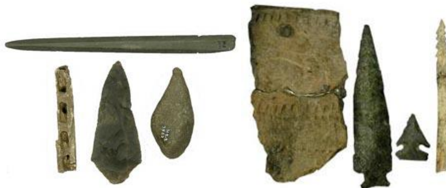
Archaic Period Artifacts

The lowest level of Taft Point did represent an older, distinctly different culture from the upper levels. The earliest level at Taft Point produced an assemblage of tools including plummets, ground stone tools, slate points, hammerstones, and stemmed projectile points. This tool kit grouping is associated with the Late Archaic Period by archaeologists and dates to between 5,000 and 3,000 years ago. We have also learned that the pottery-bearing levels of Taft Point date to the Ceramic Period. Dating to the most recent 3,000 years of the archaeological record, the Ceramic Period tool kit includes clay pottery, small notched projectile points and bone tools.